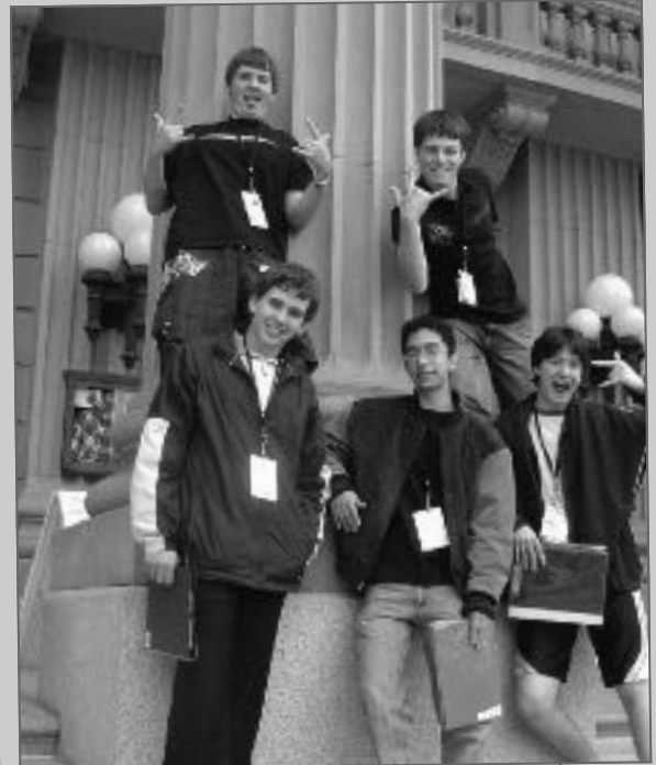
Kennebecasis Valley (N.B.) team in front of the Alberta Legislature.

Thanks to the continuing support of our sponsors, at the