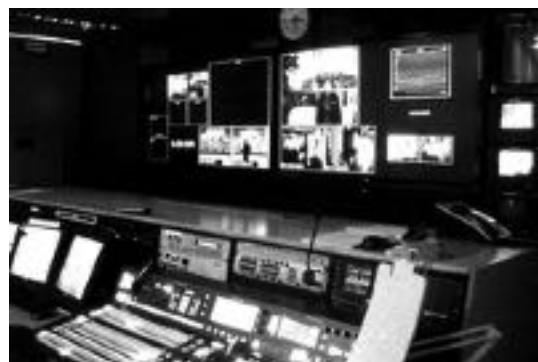
Master Control at the National Finals