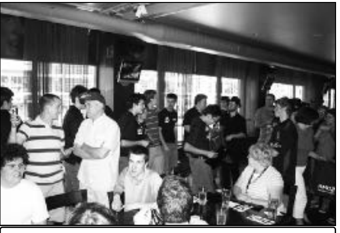
At the Hard Rock Café for the 2010 National Gala Banquet

become a fan and follow us on facebook facebook.com/reachforthetop