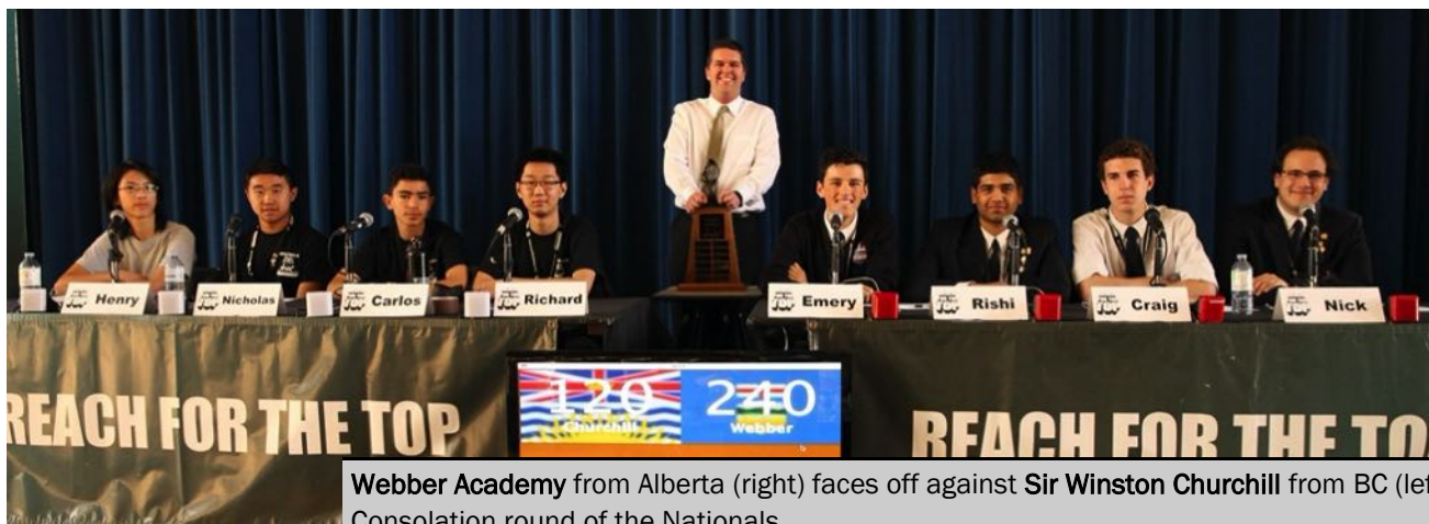
Webber Academy from Alberta (right) faces off against Sir Winston Churchill from BC (left) in the Consolation round of the Nationals.