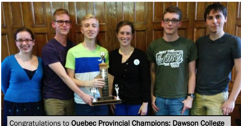
Congratulations to Quebec Provincial Champions: Dawson College