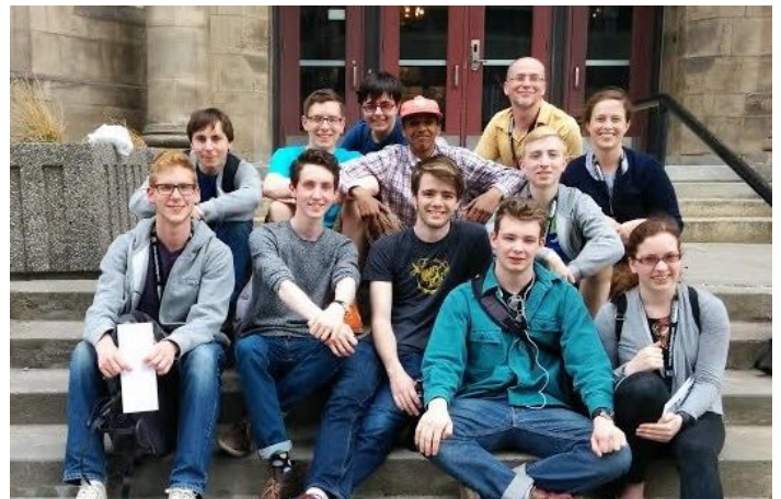
Dawson College (QC) and Kelvin H.S. (MB) hanging out at UTS.

All participating National Finals team captains pose with their team plaques