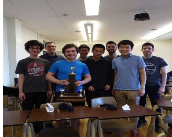
Congratulations to Quebec Provincial Champions: