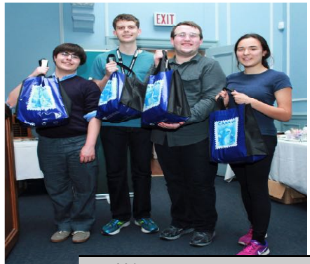
The 2017 National Finals MVP's